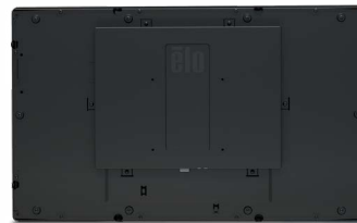
New sleek finished enclosure

Select from a wide range of sizes—from 10" to 27"—to fit in any gaming environment. Other Elo products extend the range to 70"