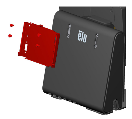
Remove the mounting screw covers from the back of the AiO and attach the bracket using the 4 screws included with the kit.