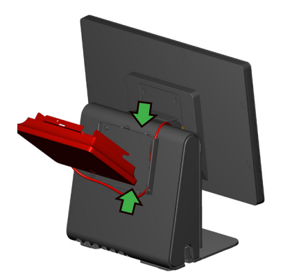
Hook the rear facing display bracket onto the AiO bracket and secure using 1 M3 screw (included in the kit) on either the top or bottom (marked by green arrows) of the bracket.