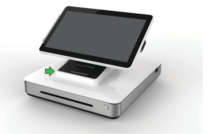
Power on the register : Press the power button. If an ethernet internet connection is available, registration will start automatically when the device powers on.