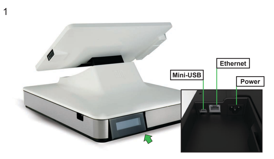
Connect power and ethernet cables : Connections are underneath the register near the back.