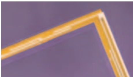
Z-border electrode pattern for enhanced linearity

* Always store the touch screen sensor and controller in its original shipping container. Never store them in an environment where condensation may form.