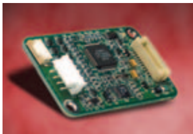
2216 combo controller board