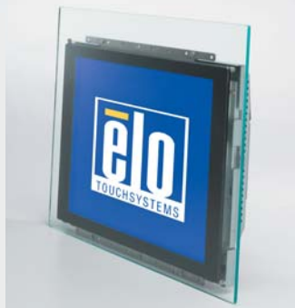
1547L ThruTouch monitor (overlay glass shown for illustrative purposes only)