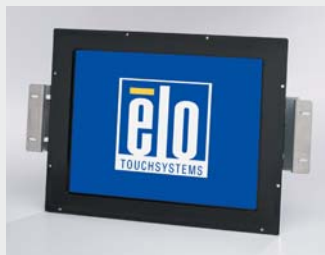
1547L DirectTouch monitor

The Entuitive 1547L 15" Liquid Crystal Display (LCD) touchmonitor uses the latest projected capacitive touchscreen technology with a choice of DirectTouch or ThruTouch options enabling touches to be sensed through a protective layer in front of the display.